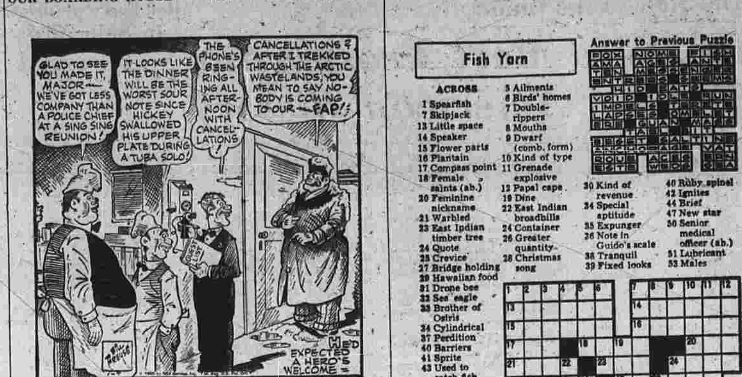
OUR BOARDING HOUSE with MAJOR HOOPLE