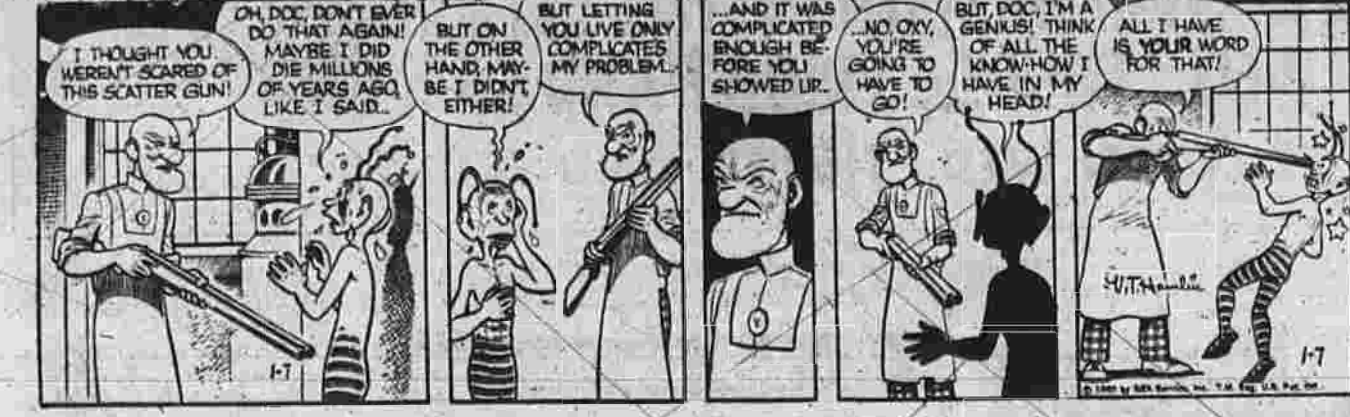
ALLEY OOP BY AL VERMERR