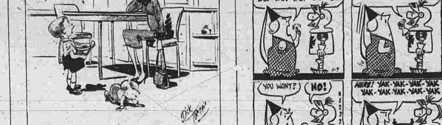
LITTLE SPORTS BY ROUSON