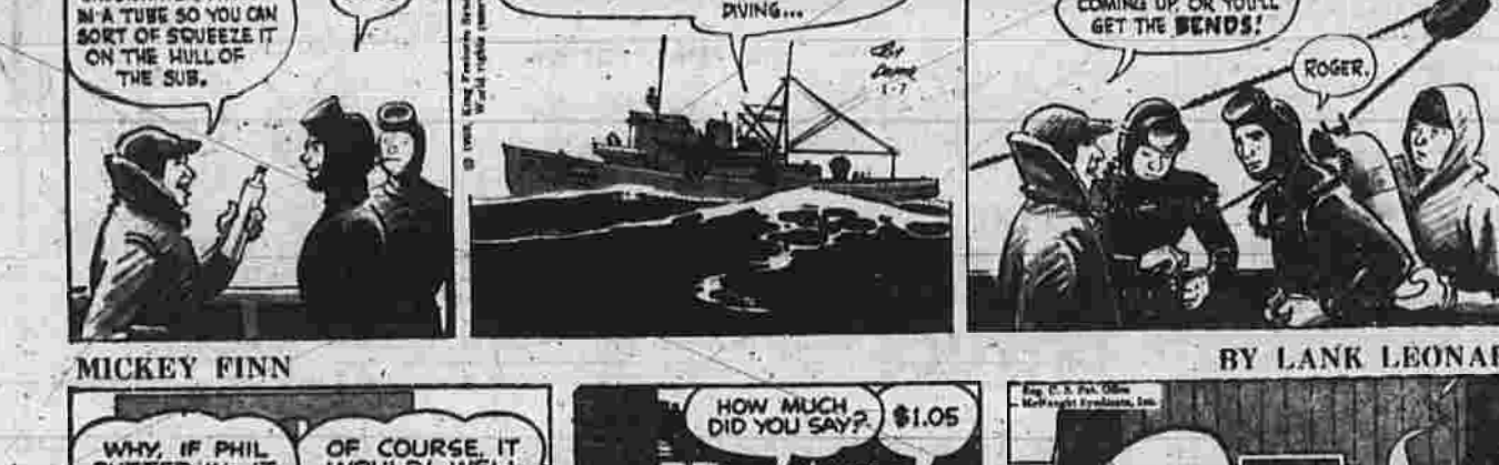
BUZZ SAWYER BY ROY CRANE