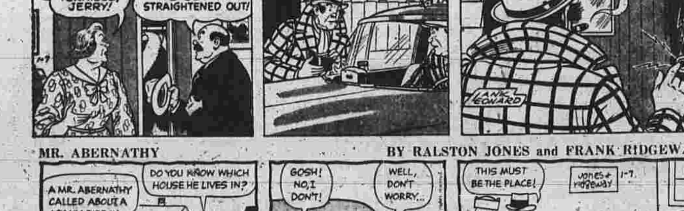
MICKY FINN BY LANK LEONARD